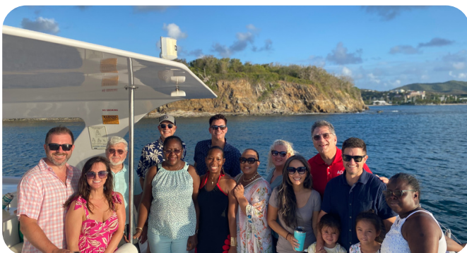
ST. CROIX, U.S.V.I.